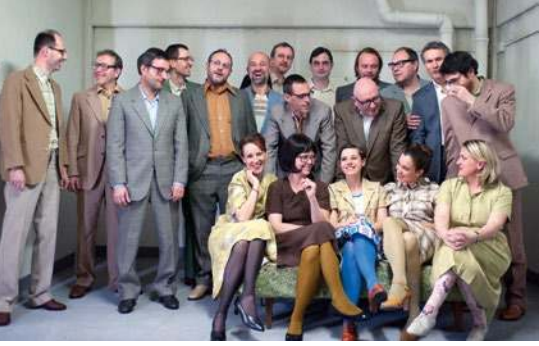
(Klangforum Wien)