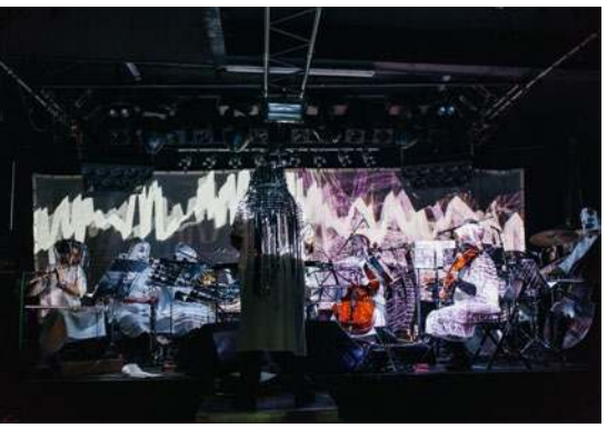
(Black Page Orchestra)