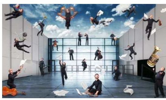
(oenm / Photo © Andreas Hechenberger and Markus Sepperer)