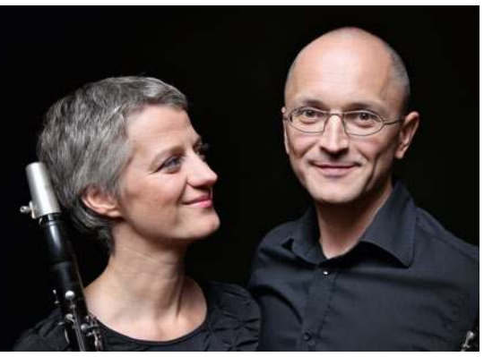
(Duo Stump-Linshalm / Photo © Viktor Brázdil)

Named after a composition by Frank Zappa, the Black Page Orchestra has emerged as one of the most promising young ensembles in Austria within just a few years. Key to this is its consistent search for radical, uncompromising, and sometimes provocative pieces of new contemporary music. Under the artistic direction of the composer Matthias Kranebitter, the "antidisciplinary" ensemble focuses on pieces from the current generation of young composers. Foregrounded are compositions that - with the help of multimedia enhancements, ambitious lighting, generative programming and much more - react to current technology and interweave widely different artistic practices. In heterogenous soundscapes and multi-sensory experimental arrangements, the ensemble finds an equivalent to the information flood on media and the accelerated pace of our present day. It also enjoys tackling pieces which through their performative character, subvert the typical concert situation. Website > blackpageorchestra.org