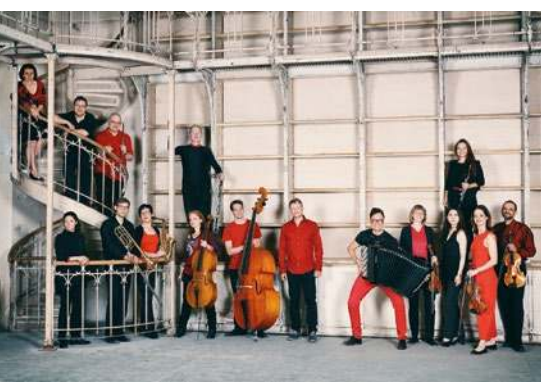
(Ensemble Reconsil Wien)